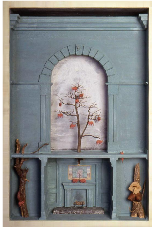
ELEPHANT DREAM – 26" X 39" X 6" – ASSEMBLAGE