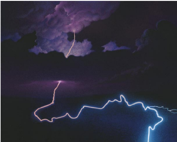
DRILLED – 10" X 8" – ACRYLIC ON MASONITE

Linda's acrylic paintings are characterized with a whimsical sense of life as displayed in her portraits and landscapes