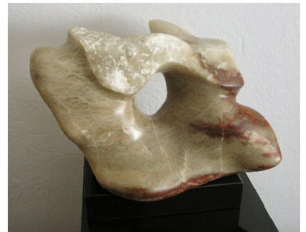
PASSAGE – 15"W X 12" H X 6" – ALABASTER

Meticulous attention to detail and clean color are documented in this series of photographs on environmental subjects