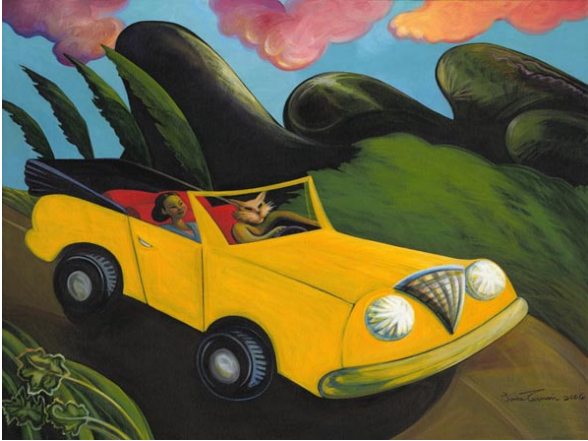
YELLOW CAR – 24" X 18" – ACRYLIC ON CANVAS